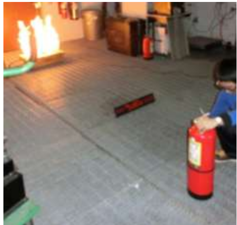
Figure 8: Participant viewing the label on the BullEx Smart Extinguisher while BullEx ITS was active

Table 3, Percent Improvement with Training for Key Milestones of Usage, shows the percentage improvement from Trial 1 to Trial 2 for key milestones of usage. Overall, all 276 participants were able to discharge agent. There was a 46% decrease in discharge agent time. And there was a 20% decrease in reading the label.