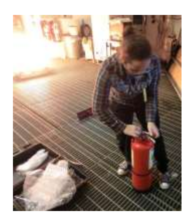
Figure 17: Participant turning back to the fire while attempting to free the pin from the BullEx Smart Extinguisher

Figure 17 shows a participant turning her back to the fire. The participant immediately turned her back to the fire to read the label and then attempted to free the pin from the fire extinguisher.