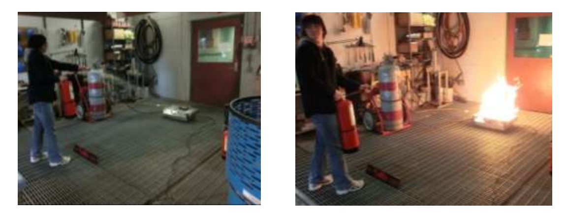
Figure 12 and 13: Participant is not continuously deploying agent

Figures 12 and 13 shows a particpant extinguishing the fire but but not continuing to deploy agent. The fire re-ignites in Figure 13 as the participant begins to turn away from the fire.