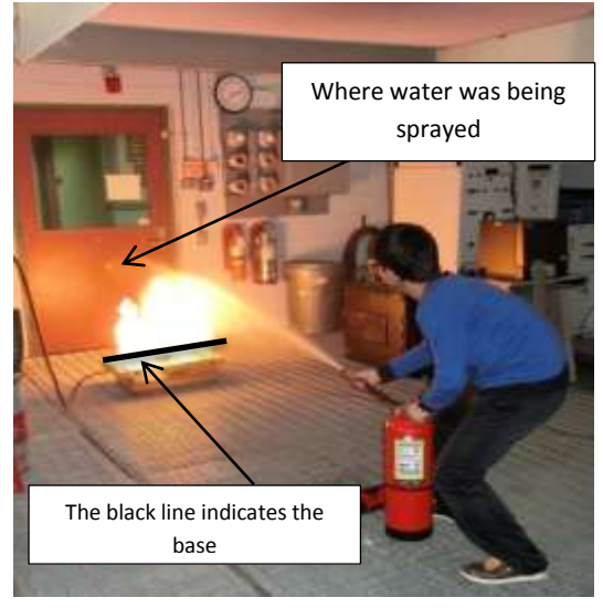
Figure 9: Participant aiming above the base of the BullEx ITS

Table 6, Percent Improvement of Technique in Handling a Fire Extinguisher, shows the percentage improvement from Trial 1 to Trial 2. Overall, 276 participants improved their ability to aim at the base of the fire by 21%, so 93% aimed at the base. Participants improved their ability to use the proper sweep technique by 22%, so 96% used the sweeping back-and-forth motion. Finally, 83% of participants continued to spray after the fire was not visible, a 35% increase.