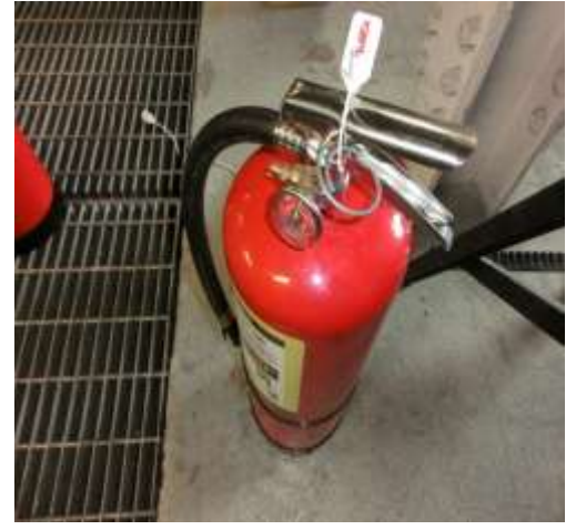
Figure 7: BullEx Smart Extinguisher filled and ready for use.

This section details the study methodologies used for selecting participants, setting up the BullEx ITS, conducting