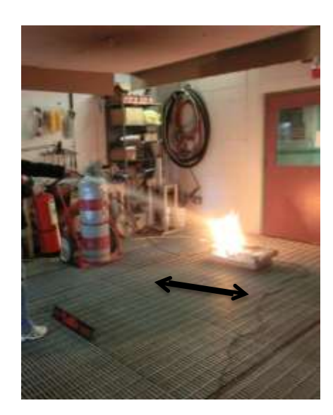
Figure 11: Participant using a sweeping motion to deploy agent on BullEx ITS

Figure 10 shows a participant correctly aiming at the base of the BullEx ITS unit. The participant also used a slow sweeping motion as she aimed at the base of the flames to deploy agent.