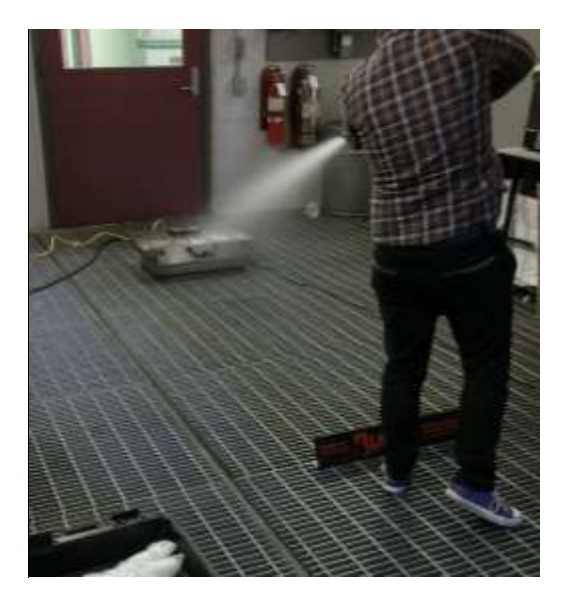
Figure 10: Participant aiming at the base of the BullEx ITS

Figure 9 shows the participant incorrectly aiming at the top of the flames. The compressed air and water mixture was depolyed to the top of the flames and sprayed the door instead of the base of the flames. A black line was added to indicate where the base of the flames are.