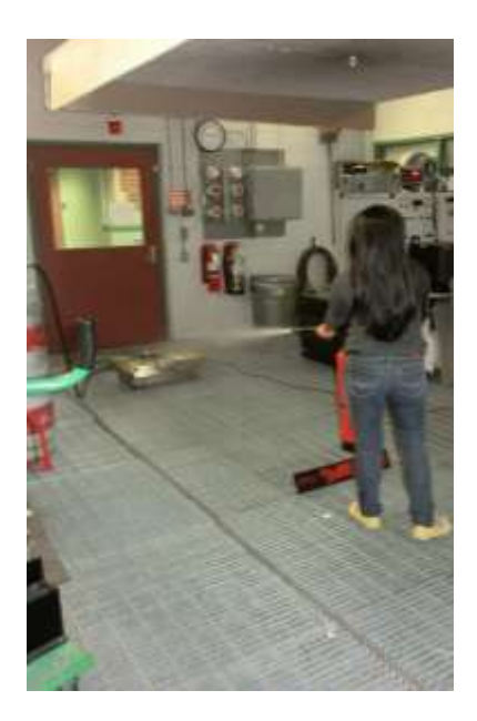
Figure 14: Participant continuously deploys agent on propane fire, thereby preventing re-ignition

Figures 12 and 13 shows a particpant extinguishing the fire but but not continuing to deploy agent. The fire re-ignites in Figure 13 as the participant begins to turn away from the fire.