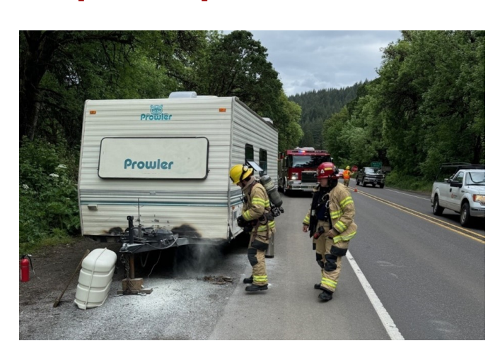
"A little two-and-a-half-pound extinguisher can save your house."

An Oregon man is being credited for his quick thinking after his camper caught fire while driving on the highway. When he noticed smoke emanating from the camper, the man pulled over, called 911, and then used a portable fire extinguisher to knock down the flames. He was then able to safely unhitch his vehicle and move it away from the camper. When firefighters arrived on scene, they made sure the fire was fully out. Fire officials noted that the man's actions prevented serious damage and a potentially dangerous situation. [Read more]